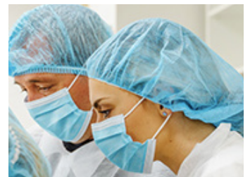
Bouffant / Beard Covers