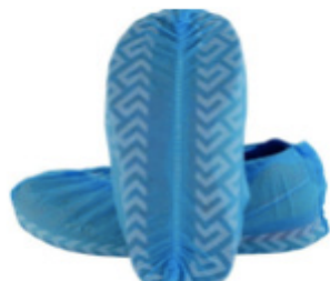
Shoe & Boot Covers