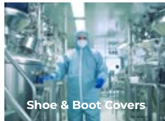
Shoe & Boot Covers