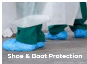
Shoe & Boot Protection